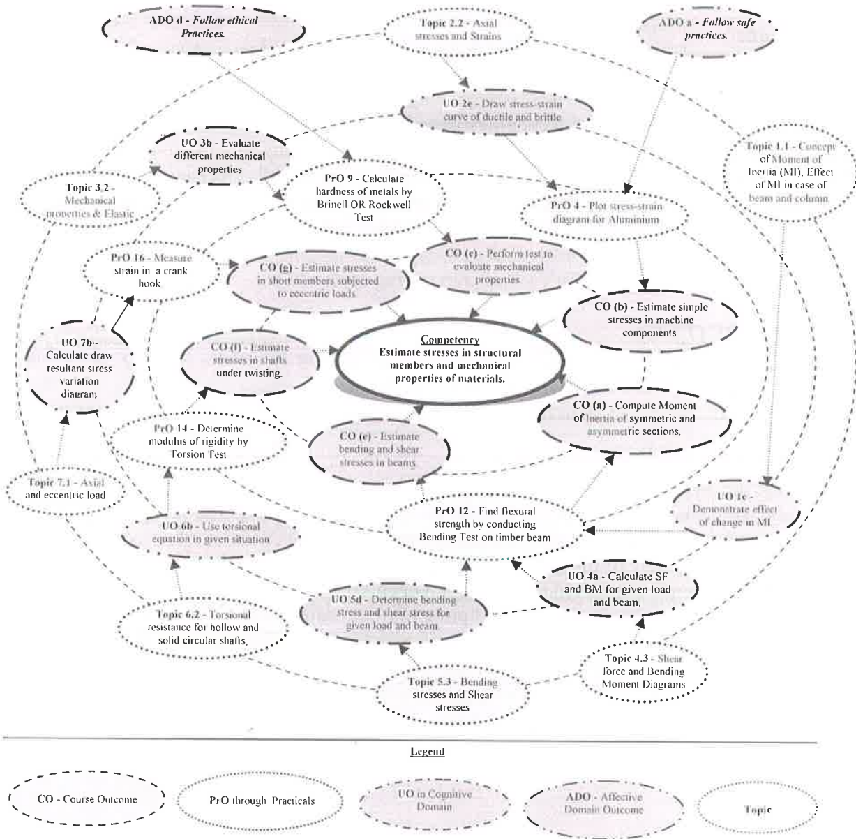
Figure 1 - Course Map

This course map illustrates an overview of the flow and linkages of the topics at various levels of outcomes (details in subsequent sections) to be attained by the student by the end of the course, in all domains of learning in terms of the industry/employer identified competency depicted at the centre of this map.